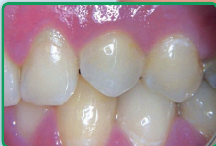
Clinical follow up 3 years post application.