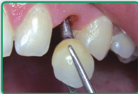
Clinical application of the restoration.